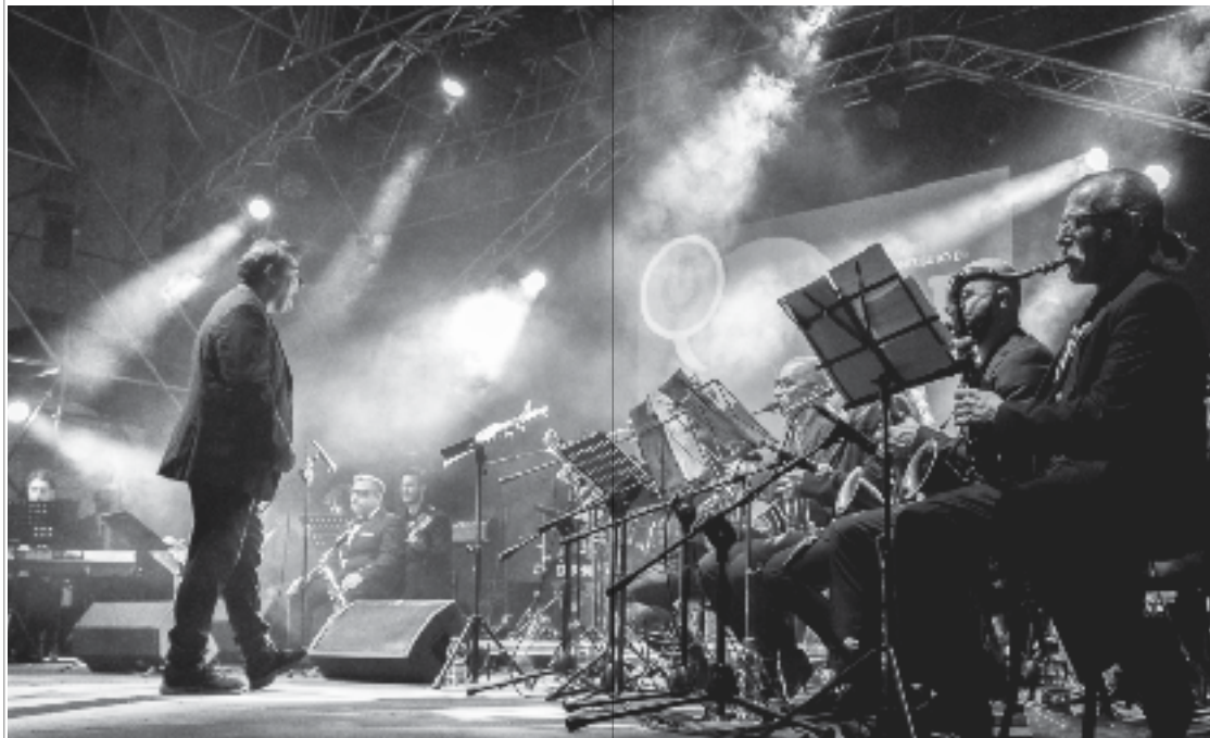
Terni Jazz Orchestra